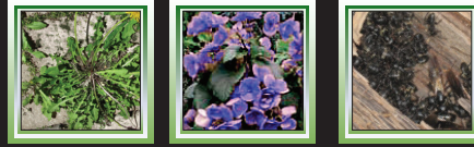
Herbicides Fertilizers Pesticides